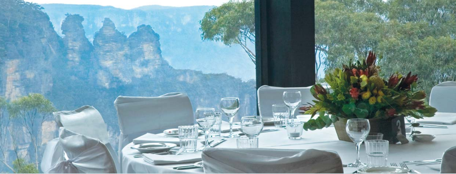
Table Share Menu